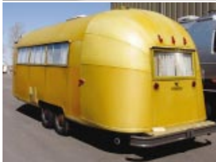
Restored trailer wheel wells have flat tops again. New gold anodizing has weathered since 1996.

Over the next decade, the Watsons kept Wally's adventures alive by taking the Gold Trailer on Caravans to Eastern Canada, Eastern Mexico, Baja and Western Mexico, Central America and the Canada Artic Northwest Territories. In a misguided effort to keep up with the times, Bob modernized the trailer with new round-cornered exterior hatches and windows, a tall multicolor stripe around the body, a vista view window in the upper door, new large script lettering and contemporary emblems, aluminum wheels, a permanent mounted awning, a roof top air conditioner, and so forth. The overall effect was a mild case of pimp-my-trailer. Sadly, while its place in Airstream history was being celebrated its integrity was being violated. The Gold Trailer fell into mild disrepair over the next ten years and needed some attention. It deserved a better fate, soon to arrive.