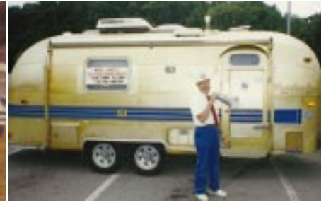
Left: Travelette's gold paint complements the Gold Trailer at a 1958 Midwest Rally. Right: Gold Trailer as modernized in the 1980s.

Caravan traveling along a typical "Byam Boulevard" (a very rough road).