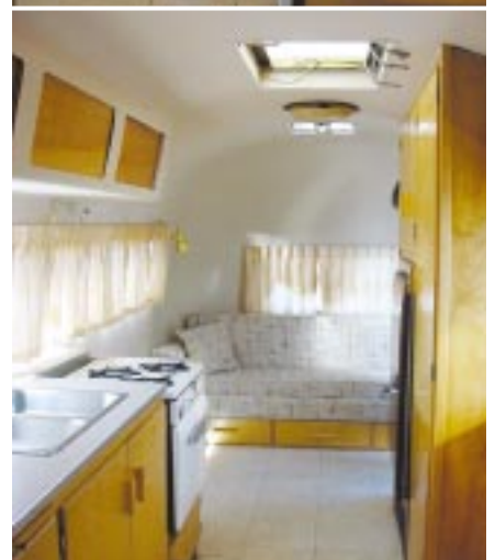
Top: Restored interior looking towards the rear, single bed at left. Bottom: Restored interior looking forward. Wally's roof hatch is a signature feature.